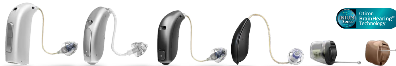
Hearing aids shown in actual size. Available in many different colours.